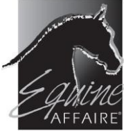
EXHIBIT & PRODUCT SUMMARY EQUINE AFFAIRE® November 9-12, 2023 W. Springfield, MA

Complete and return this Exhibit & Product Summary along with your Application & Contract for Exhibit Space, and deposit. We cannot process your Application without receiving these essential documents from you.