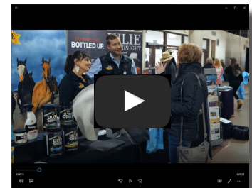
Embed a video into your ad and, when clicked, it will pop out for viewing.